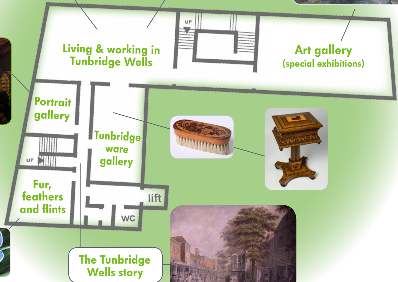
The Tunbridge Wells story