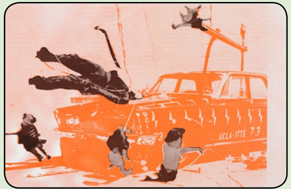
Image credit: The Accident Syndrome, the Genesis of Inquiry (Copyright the artist and DACS)

Paolozzi's canny alchemy is vividly apparent in General Dynamic F.U.N, a series of fifty screenprints and photolithographs created between 1965 and 1970. Here Paolozzi employs the technologies of mass-reproduction and gorges on its idols – the household names and familiar faces of consumer advertising, high fashion and Hollywood. The artist's friend and sometime collaborator, J.G. Ballard, described General Dynamic F.U.N as a 'unique guidebook to the electric garden of our minds'